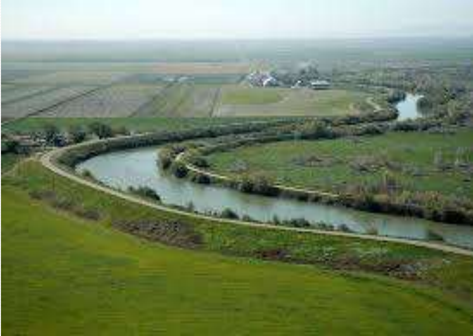
PHOTO OF RIVER DELTA